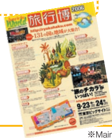
※Mainichi Newspapers Sept. 16

※Also published special features and promoted the event on its websites.