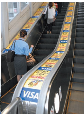
Escalator rail ads