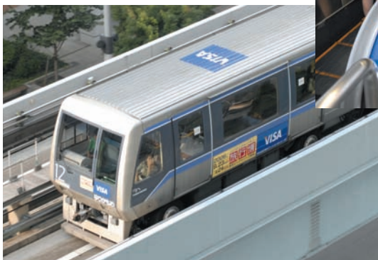
Train exterior ads

Inside ads posted below train windows Escalator belt stickers (Shimbashi Station) Escalator rail ads (Shimbashi Station) Stickers below ticket vending machines